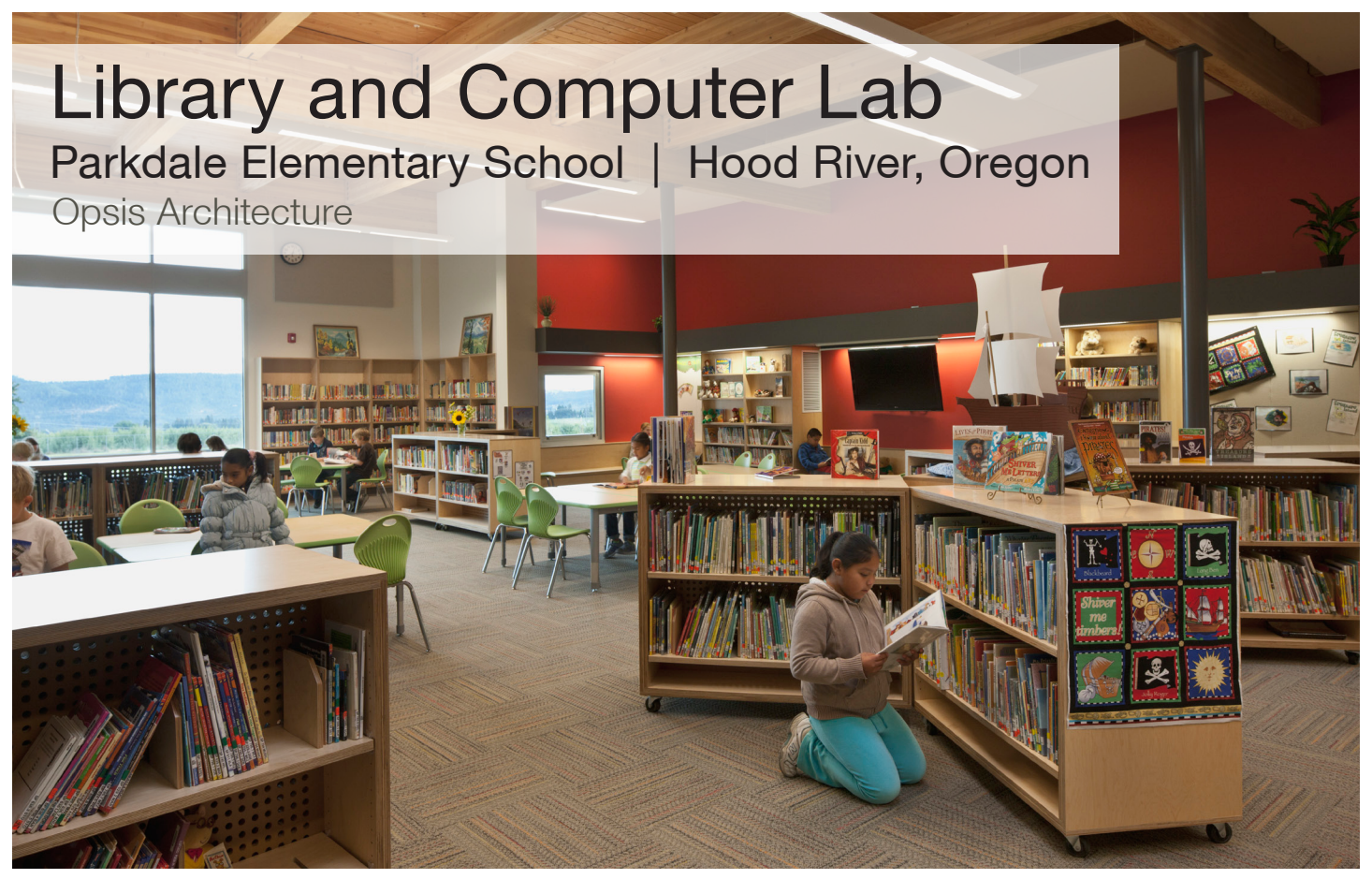
Warm tones and wood finishes, visible to the exterior, complement the rural mountain community.